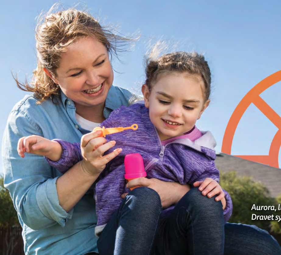
Aurora, living life with Dravet syndrome